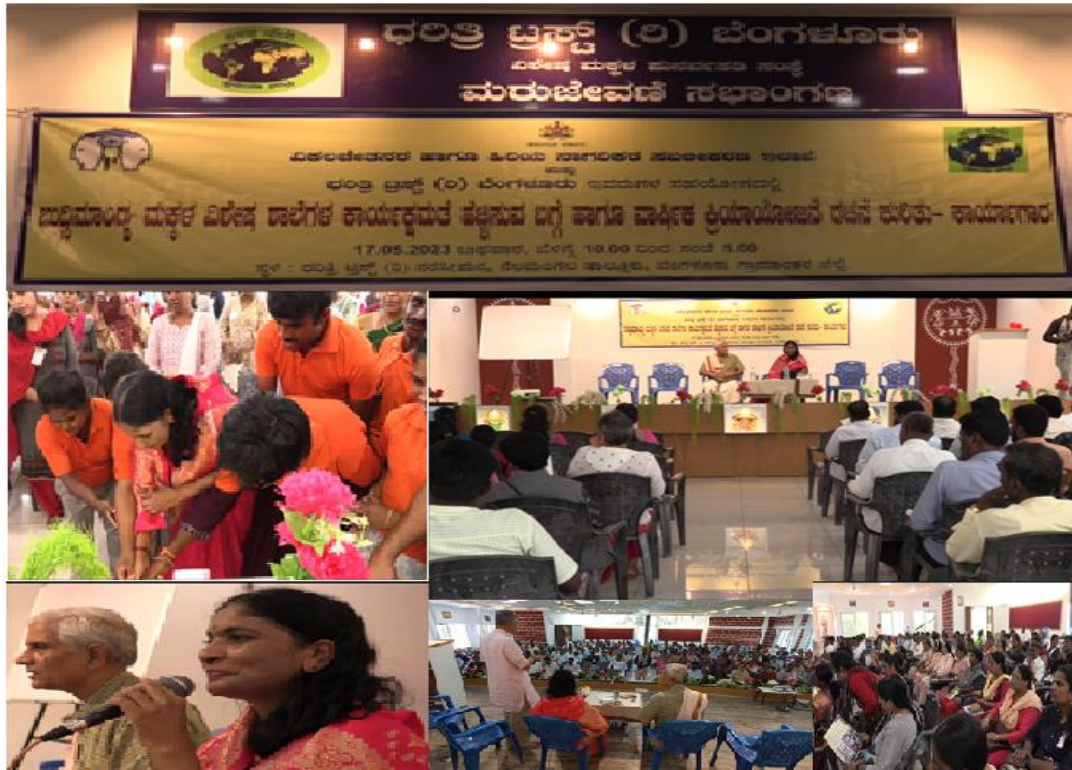
In the quiz competition Quizabled organised by Seva In Action on the occasion of International Day of Persons with Disabilities our children participated and stood first in the state level.